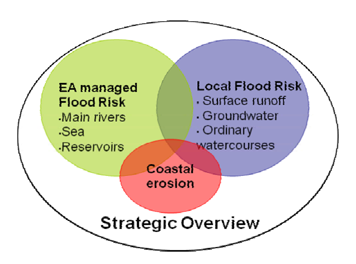
Figure 1 – Summary diagram of Strategic Overview

of the period, applications had been received in excess of the £5m available. Applications were short listed considering a number of factors including the number of properties to be protected and value for money. The short list had to be decided based on the information presented in the application forms. The final decision was made in March 2010 following review by an independent panel and a Ministerial submission. 61 schemes and 15 Surface Water Management Plans were funded.